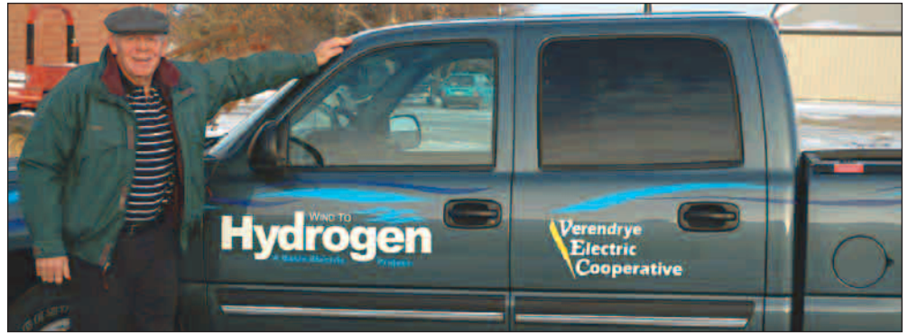
VEC General Manager Bruce Carlson is proud of the hydrogen-powered pickup VEC leases with the purpose of developing data to determine hydrogen power feasibility in our area.

As an alternative, electric cooperatives are going to convert wind-generated power to hydrogen by running it through an electrolyzer, converting water to hydrogen gas and oxygen. The cement pad and electrical service for this project have been