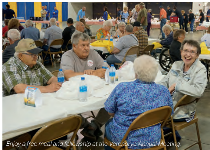
Enjoy a free meal and fellowship at the Verendrye Annual Meeting.