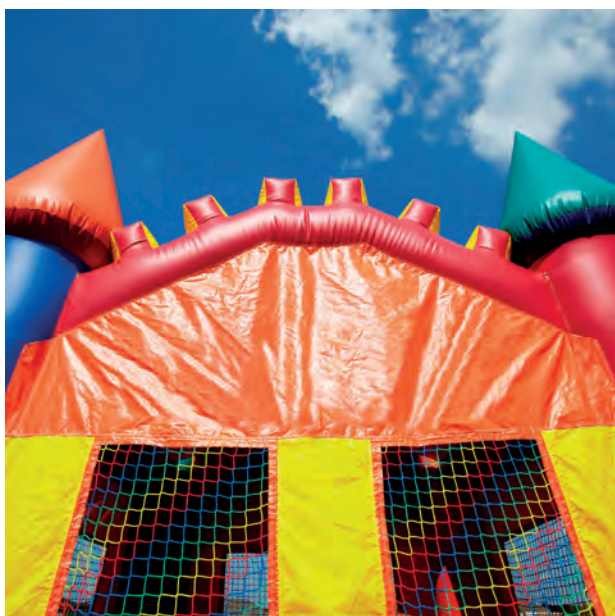
There will be bounce houses, a carnival and prizes for kids, including two bikes to be given away.

Verendrye members attending the meeting will receive a free multi-bit screwdriver.