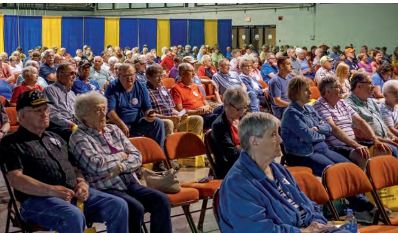
Verendrye Electric is owned and controlled by its members who get to vote for their board of directors and on other matters such as resolutions.

(RUS) Program systems serving areas with low consumer density per mile of line. We strongly encourage Congress to fully fund the insured RUS loan program and the guaranteed loan program. This financing is crucial to the rural way of life.