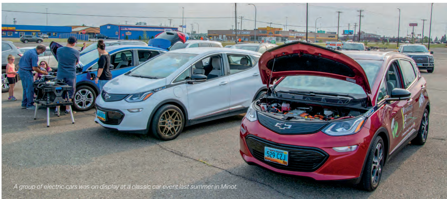
A group of electric cars was on display at a classic car event last summer in Minot.